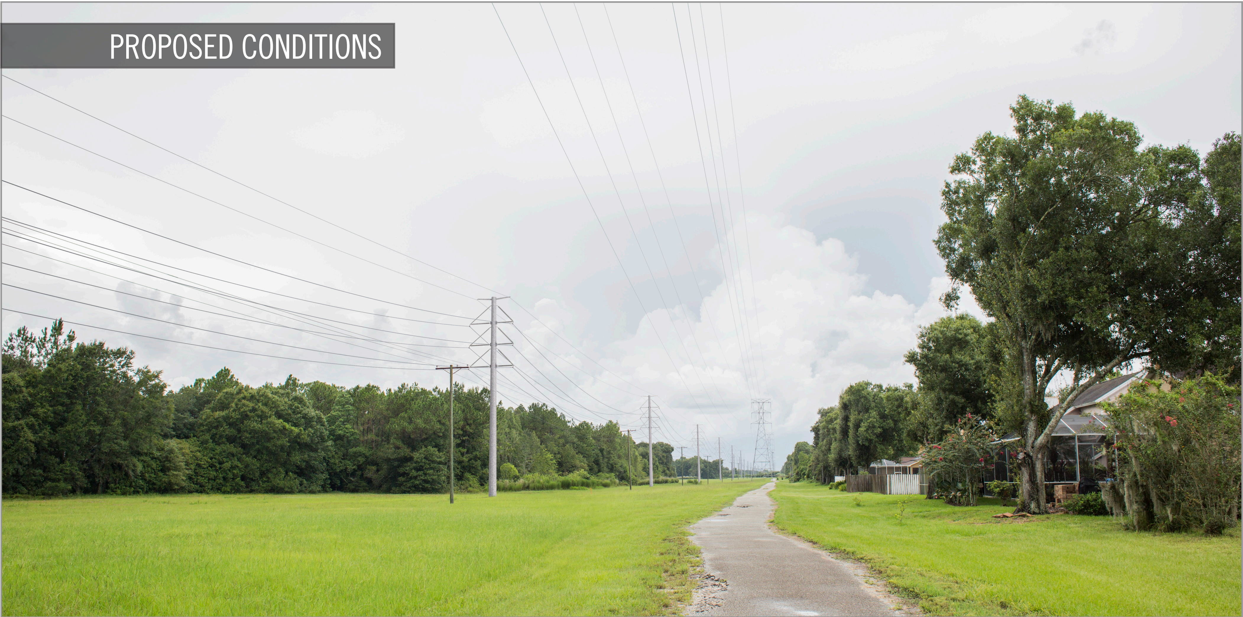
Photo simulations are for discussion purposes only. Final design may change pending public and regulatory review.

DATE: 7/15/15 TIME: 5:20 PM LOOKING: West